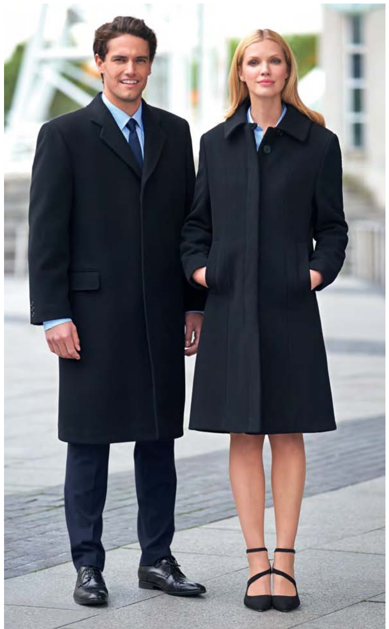
Matching Bond and Burlington Overcoats